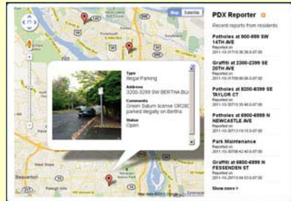
Recent reports from residents using PDX Reporter